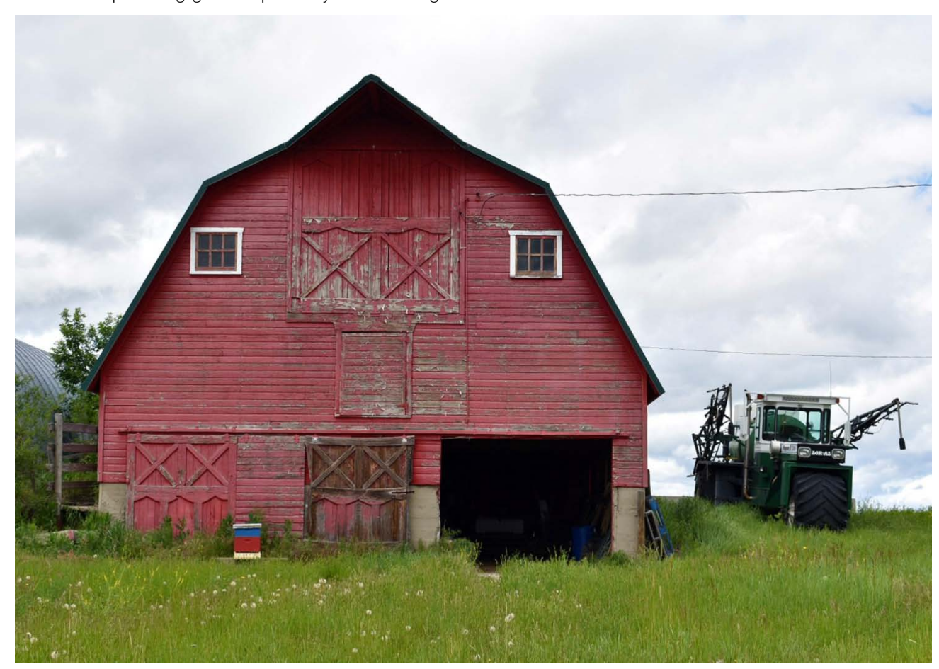
Image 1: Barn built by settler Hiram Massion and his siblings and their spouses. They all lived together in the barn until they had houses to live in on their own homesteads]

Harsh winters and drought challenged the newcomers at every turn. Surely this life was better than what they had left behind in Europe, but still, it had its difficulties; Massion (2017) even notes that despite the small size of the colony, desperation at times prevailed; theft of crops and livestock from one another was a relatively common occurrence.