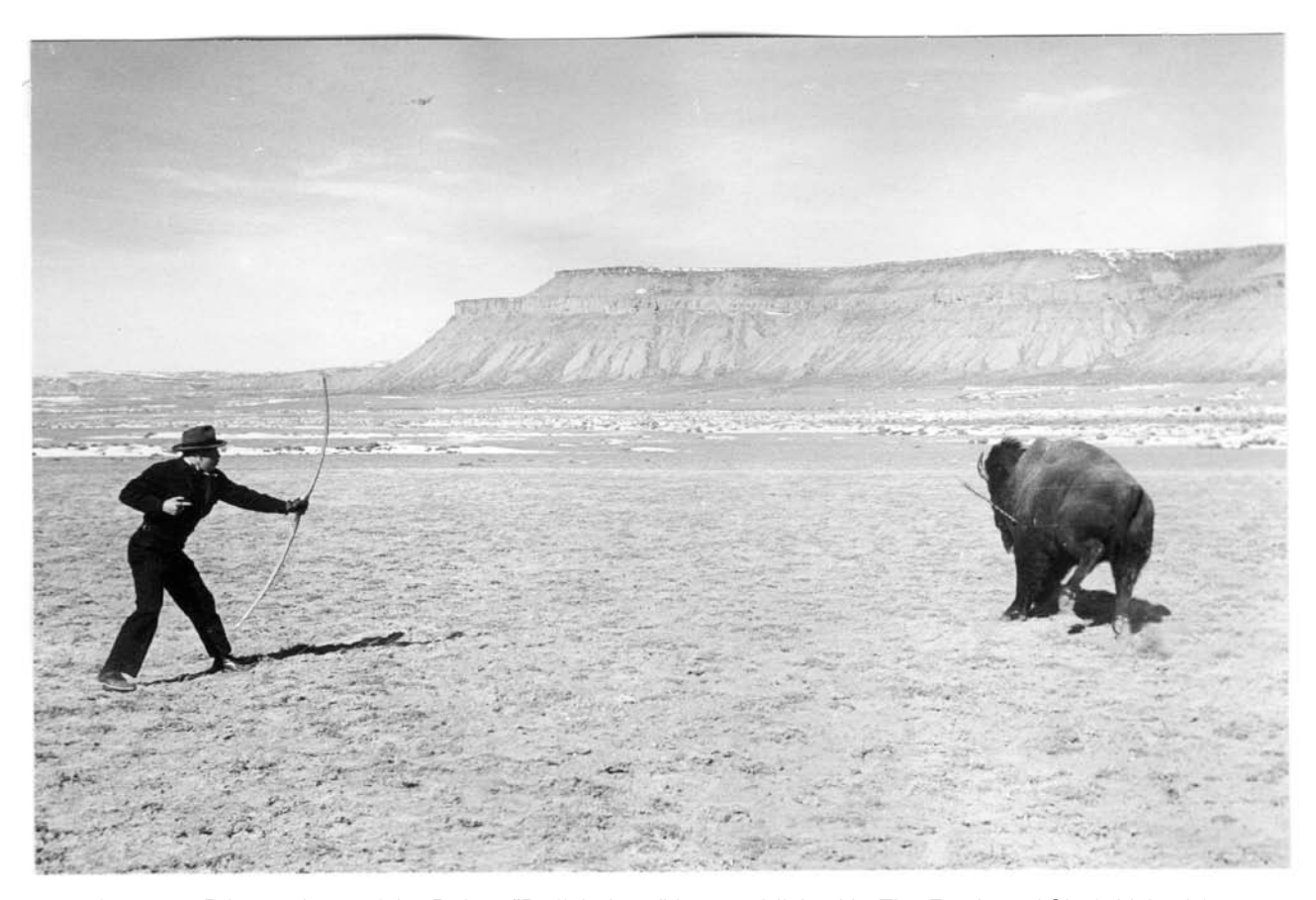
Image 3: Private photo of the Bolten "Buffalo hunt" later published in The Feathered Shaft, Vol. 1(1), May 1947

Bolton held these "buffalo hunts" for a few years and in truth, they did enjoy popularity.