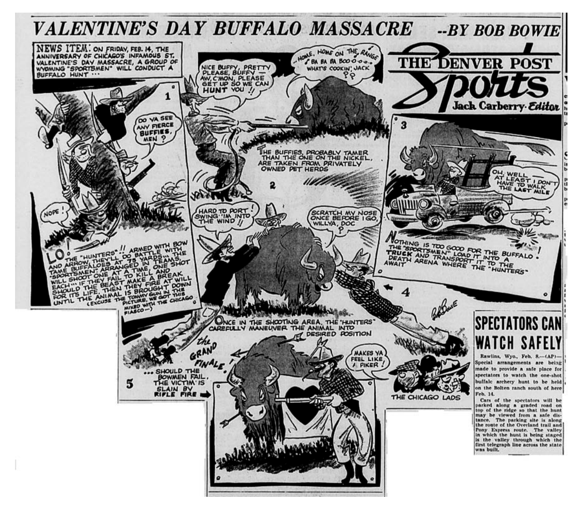
Image 4: The Bolten "Buffalo hunt" lampooned, February 9, 1947.

The truth of the matter is that from all indications, Ethel did not go west until after her widowed father's death at the age of 81 later that year (1920). No information can be found to indicate when this move occurred, or what prompted this decision. But by the time of their marriage in 1926, Isadore was 41 and Ethel was a bit older, 48. While such an age difference means little in the 21st century, it may have been an issue in early 20<sup>th</sup> century Rawlins, at least if census reports are any sort of indicator. In the 1930 Rawlins census, for example, Isadore is said to be 45 years old - his correct age - but Ethel, it is written, is said to be 40. That would mean that she was born in 1890, 3 years after her mother's passing (in the 1880 Chicago census her correct birth year is indicated). In the 1940 census, Isadore's age is listed as 55 - again his correct age given that he was born in 1885. But here Ethel is listed as being only 3 years younger, 52. Were that the case, she would have been born in 1888 - once again after her mother's death.